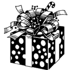
Gift of Life

Brighton FUMC is sponsoring an American Red Cross blood drive on December 23. It will be our third Christmas season blood drive and one of Livingston County's last blood drives for 2011. Have you ever needed blood, or known someone that needed blood? Blood drives help save lives, and they are very important for maintaining supplies around the Christmas holiday. This is an opportunity for us to help give someone the gift of life, but we need volunteers and donors in order to make this blood drive another success!