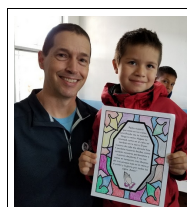
Photos were taken during our 2020 VIM Mexico Mission.